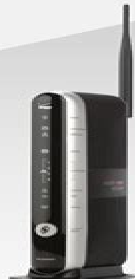
MI424WR Rev. E

Verizon's FiOS router features an advanced hardware design including an industry-first 64-bit, dual core processor. The router's 64-bit architecture provides a substantial performance improvement over the 32-bit devices sold today. The router's latest MIPS core offers further performance improvement and