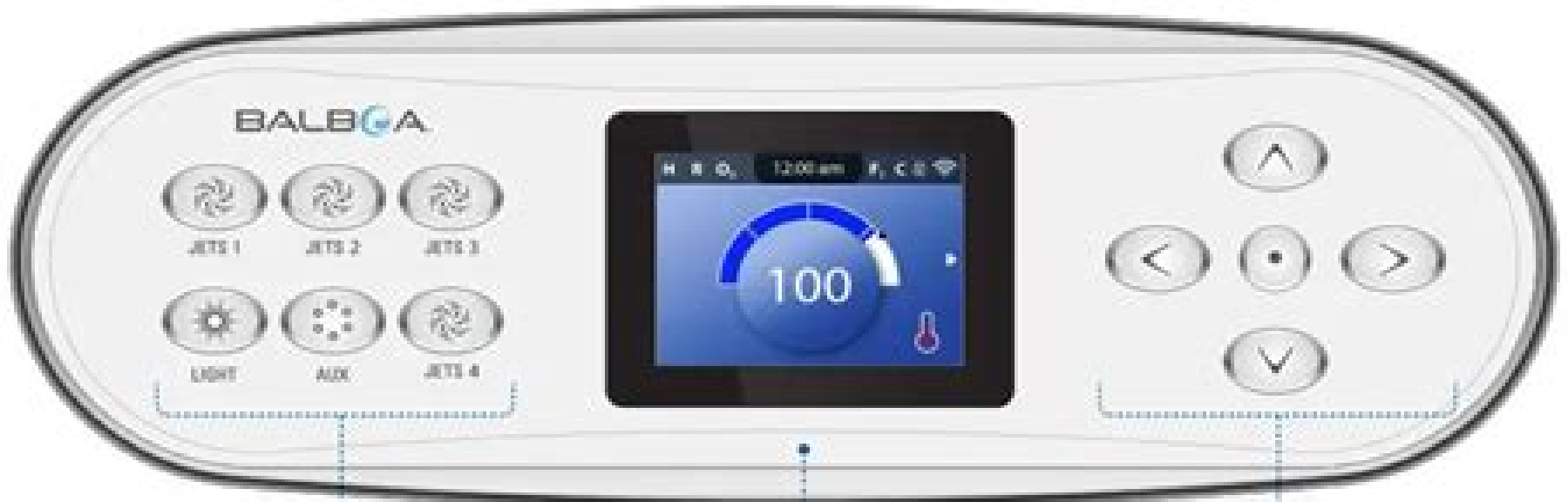
Spa Device Buttons