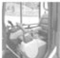
Short stroke operating lever and wrist rest