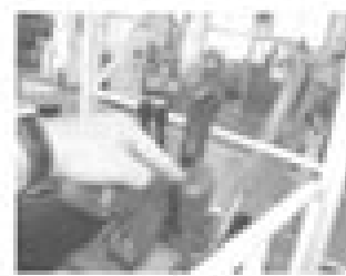
High speed travel switch on the dozer lever