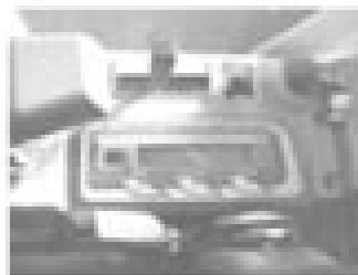
Digital panel with new navigation system