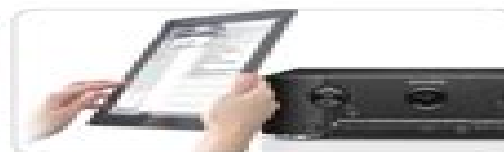
Stream music from your iPad®, iPhone® or iPod Touch® or from your iTunes® music library