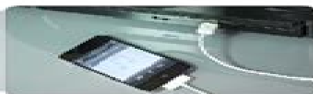
Front Panel USB input