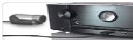
Front Panel HDMI input