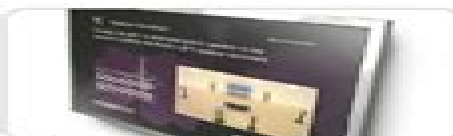
GUI Overlay with upscaling 4K video