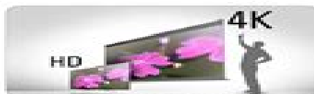
4K video support (Video passthrough, video upscaling)