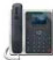
POLY EDGE E100