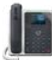
POLY EDGE E220