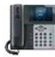
POLY EDGE E500/E550