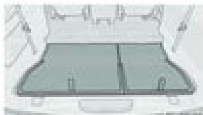
Stowed Third Row Seat