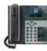
POLY EDGE E400/E450