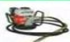
Engine Vibrator Petrol, Kerosene Engine Vibrator Head - 40 mm 3000 length Prime Mover 2 hp Engine