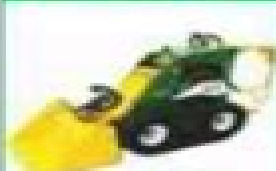
Loader Dumper Capacity 1st 2 Ton Prime mover 10hp 12 hp 14hp