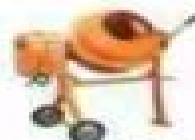
1/2 Bag Mini-mixer