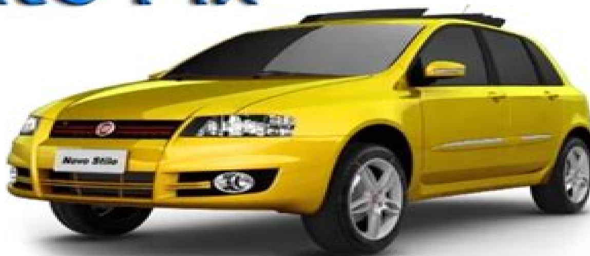
CVM - Fiat 192