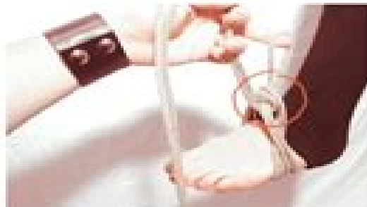
Step 4: tie an over-hand knot through all coils, as shown