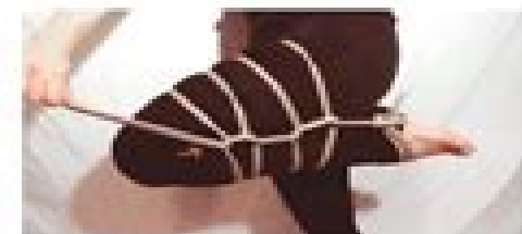
Step 10: reverse again, this time going over the thigh.