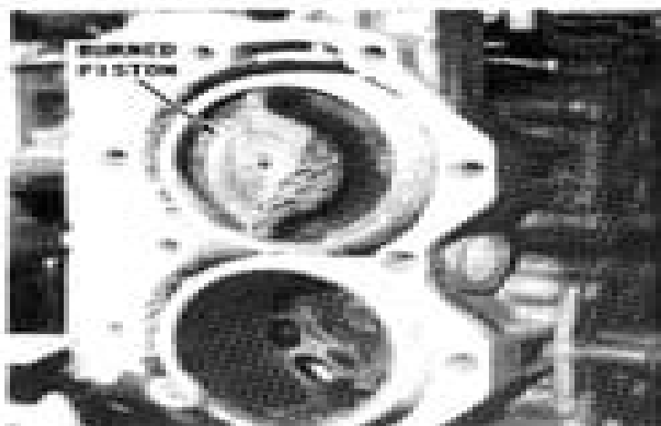
The time, effort, and expense of a tune-up will not restore an engine to satisfactory performance, if the pistons are damaged.