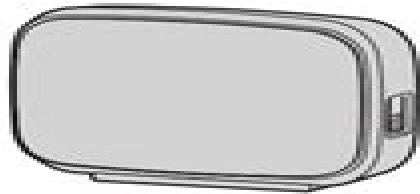
KX-TGP600G/ KX-TGP600CEG/ KX-TGP600UKG