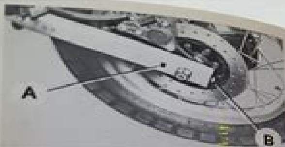
Fig. 19 - Pict. 19