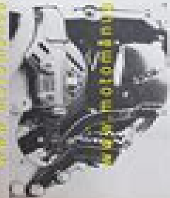
Fig. 21 - Pict. 21

The front and rear brakes working in hydraulic. There is transparent tank that permits a visual check of the oil level that must be between the minimum and maximum level marks (pict. 21), and the level operating a pump. This pump delivers pressure to the oil that shuts the pads on the disc positively to the oil that shuts the pads on the disc by two pistons (front brakes) and by one piston (rear brakes). After the first 1000 (or every 2000) km the brake system must be bled to remove air from the system. Failure to bleed the brake system properly can result in a dangerous loss of brake performance. Bleed the brake system in order of the following steps.