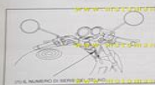
(1) IL NUMERO DI SERIE DEL CAROTTO (1) Il numero di serie del telaio è stampato sul lato destro del carottero dello sterzo.