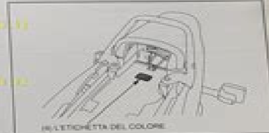
(4) L'ETICHETTA DEL COLORE (4) L'etichetta del colore è applicata sul parafango posteriore, sotto la sella. Si desidera ordinare pezzi codificati a seconda del colore, specificare sempre il codice designato del colore.