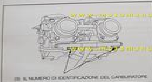
(3) IL NUMERO DI IDENTIFICAZIONE DEL CARBURATORE (3) Il numero di identificazione del carburatore è stampato sulla piastrina di aspirazione di ciascun carburatore.