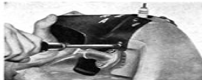
30 M Luftführungsrohr abbauen