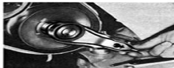
29 M Ausrückgabel einbauen

Der Einbau erfolgt sinngemäß in umgekehrter Reihenfolge des Ausbaues, wobei darauf zu achten ist, daß die Ausrückgabel zwischen dem Kopf der Begrenzungsschraube und die federbelastete Scheibe zu liegen kommt. Lagerstellen mit DKW-Spezialfett UNIVISTON DB 414 dünn bestreichen.