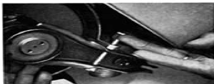
28 M Lagerbolzen aus Ausrückgabel herausziehen V5 / 55 / 1254