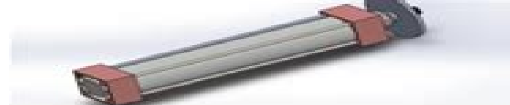
Figure 4.2 Double acting Cylinder