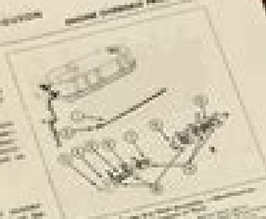
Fig. 1-5 Front View of the 400-122 Engine with Rocker Arm Shaft Assembly

Check all parts in a rocker arm shaft assembly. Check all parts in a rocker arm shaft assembly. Check all parts in a rocker arm shaft assembly.