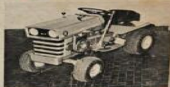
MF 8 LAWN TRACTOR AND MOWER