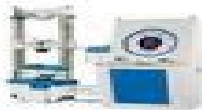
Universal Testing Machine - Mechanical