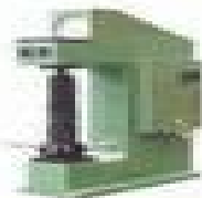
Rockwell Hardness Testing Machine