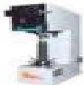
Digital Vicker Hardness Testing Machine