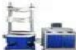
Universal Testing Machine - Computerized