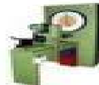
Vickers Testing Machine