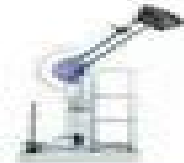
Sand Impact Testing Machine