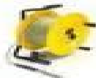
Water Level Indicator