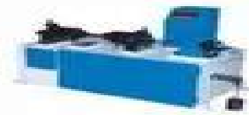
Fatigue Testing Machine