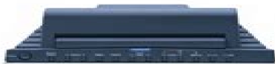
All control functions and disc loading slot are located on top of the main unit.

The main wireless remote control unit engages all the functions of the SoundSpace 5, including disc eject. The secondary remote unit controls major functions and allows blind key operation.