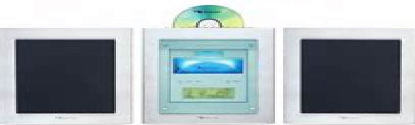
Up to 3 discs can be conveniently loaded without the use of trays or magazines.

The main unit houses a MusicBank™ 3-disc CD changer, FM/AM tuner and preamplifier. Function control buttons are arranged conveniently on the top panel. A front window allows you to see the operation of the changer, which can be illuminated subtly in blue or amber (user selectable).