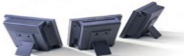
Easel-styled supports allow SoundSpace 5 to be angled when free standing. Keyholes are provided on each unit for wall-mounting.

The remarkable SoundSpace 5 system delivers stereo reproduction that rivals the concert-hall quality of full-sized Nakamichi components. Its three units, styled in contemporary brushed metal and acrylic, are designed to be arranged in a variety of ways - standing, tilted like easel frames, or even hung on the wall. Charcoal, blue or green speaker grilles are included for coordination with any room decor.