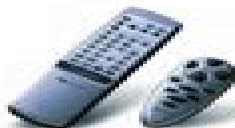
Full-function and simple remote control supplied

The inventive minds of Nakamichi have combined their legendary abilities in stereophonic reproduction with sensitivity to your need for "getaway" personal space. The result is SoundSpace 5, a stereo music system designed for personal stereo satisfaction in places where full-sized audio components are not appropriate.