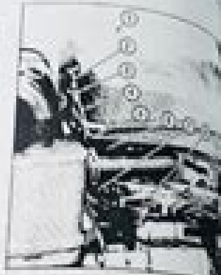
Fig. 3 - Side View of 16 HP Engine