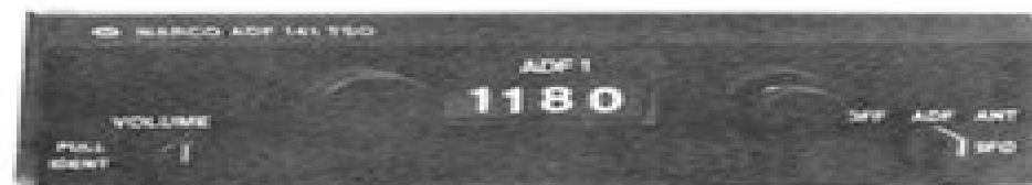
ADF 141 RECEIVER