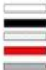
Small white plug x13598