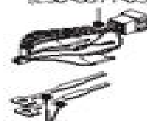
Lever (D10-7012-04) x2