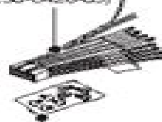
* Screw set (N99-1757-15)