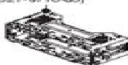
* Screw (4x16) (N64-4016-46)