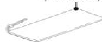
DC cord (E30-6415-15)