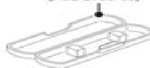
* Carrying case (W01-1692-05)