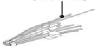
* Escutcheon (B07-xxxx-xx)