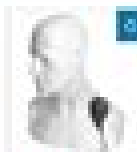
1. QUESTION [10] 2. ANSWER [10] 3. QUESTION [10] 4. ANSWER [10]