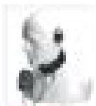
1. The first step is to identify the problem.