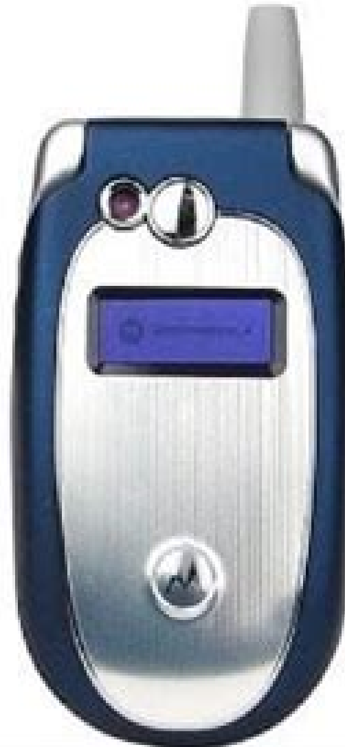
Front with Brushed Metal