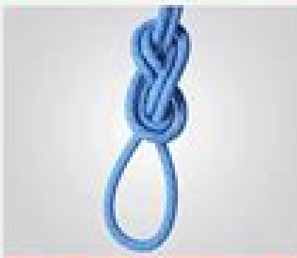
Figure 8 loop