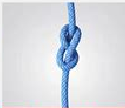
Figure 8 bend