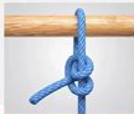
Two half hitches