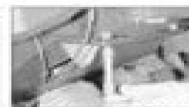
2-13: Radiator assembly (side view of the radiator)