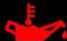
Oil Warning Light