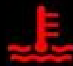
Temperature Warning Indicators