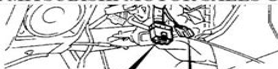
Fig. 2: Testing Ignition Switch & Key Reminder Switch Courtesy of MITSUBISHI MOTOR SALES OF AMERICA.