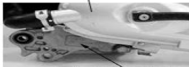
Location of Engine Serial Number