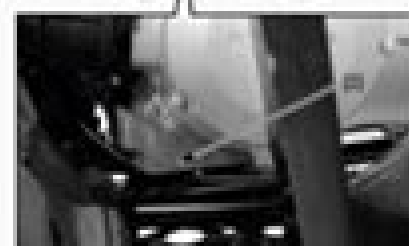
(2) Location of Engine Serial Number